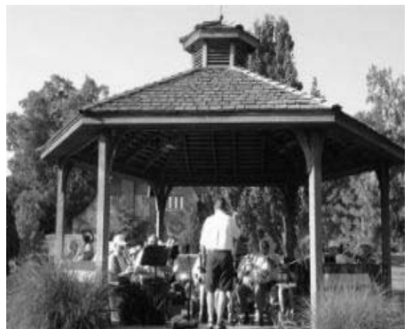
Do you recognize anyone?